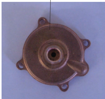
Screws of the water pressure switch Code:70102003