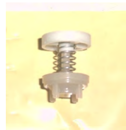
By-pass valve code:50101016