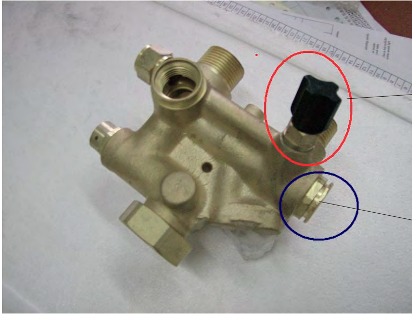
Affusion valve FUGAS code:CB11030032