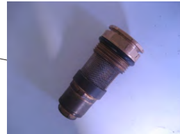
10L water flow device code: 50101006